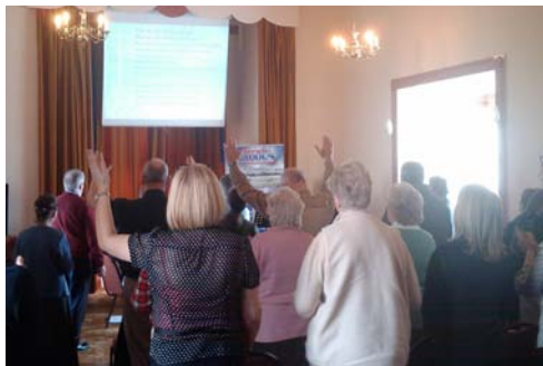
Above: Praising God together.

The Jewish authorities themselves are also helping the work of Operation Exodus,